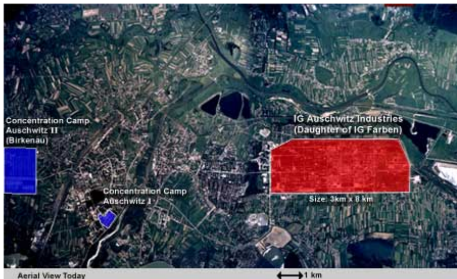
The map of Auschwitz (above) speaks for itself. The size of the IG Auschwitz plant (red area) was larger than all Auschwitz concentration camps (blue area) taken together.