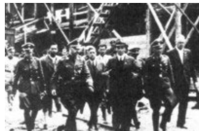
On March 1, 1941, the Reichsführer of the SS, Heinrich Himmler, inspected the construction site

There was no retirement plan for the prisoners of IG Auschwitz. Those who were too weak or too sick to work were selected at the main gate of the IG Auschwitz factory and sent to the gas chambers. Even the chemical gas Zyklon-B used for the annihilation of millions of people was derived from the drawing boards and factories of IG Farben.