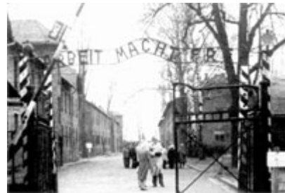
The entrance of the Auschwitz Concentration Camp

As long as the Nazi infection continues to work its influence and threaten the lives of untold millions, no German has the right to proclaim that the Nazi era is finished.