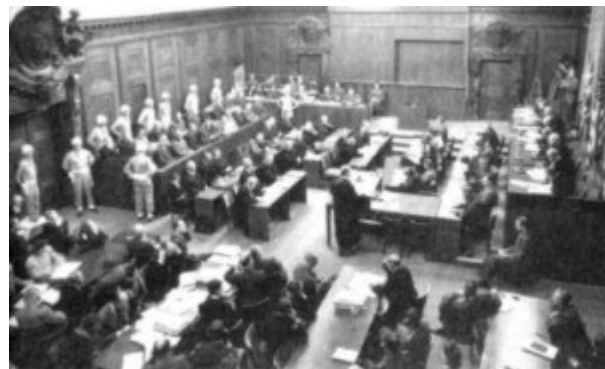
Nuremberg War Tribunal 1946/47: 24 managers of Hoechst, Bayer and BASF were indicted for mass murder, slavery and other crimes against humanity.

The result is well known: Helmut Kohl was chancellor of Germany for 16 years and the German pharmaceutical and chemical industry became the world's leading exporter of chemical products, with subsidiaries in over 150 countries, more than IG Farben ever had. Several billion people will now die prematurely, if the pharmaceutical industry gets its way. Germany is the only country in the entire world in which a former paid lobbyist for the chemical and pharmaceutical cartel was head of the government. To sum